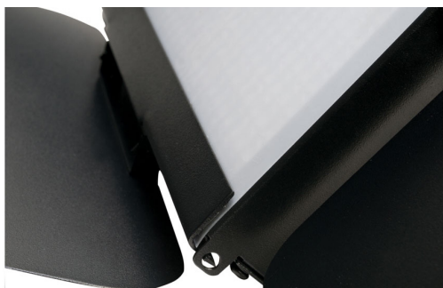
Magnetic Gel/Diffuser Holder